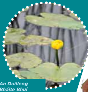
An Duilleog Bháite Bhúf Yellow Water-Lily

All along the shoreline of the lake are wetland plants which provide food and homes for colourful insects. These in turn provide food for birds, fish and small mammals. Can you spot any of the plants, animals and insects shown in the photos?