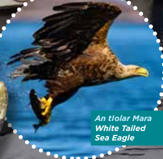
An tIolar Mara White Tailed Sea Eagle