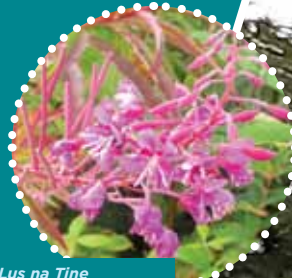
Lus na Tíne Rosebay Willowherb