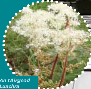
An tAirgead Luachra Meadowsweet