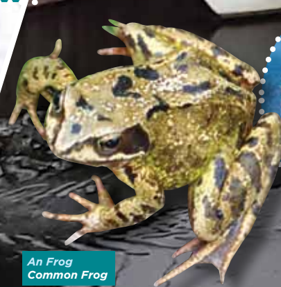
An Frog Common Frog