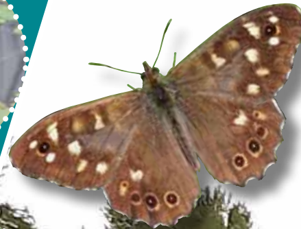
An Breacfhéileacán Coille Speckled Wood Butterfly